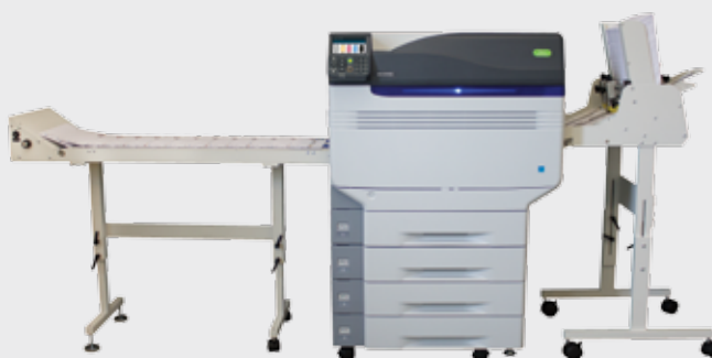
HD-CX1700 shown with optional 3-in-1 paper tray and high capacity envelope feeder and auto shingling conveyor system for maximum productivity.

The high-capacity toner cartridges also make this one of the most affordable toner-based envelope printing systems available.