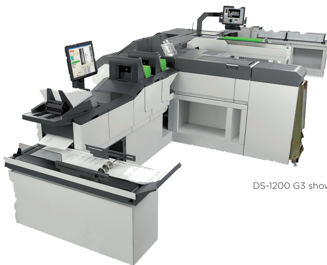
DS-1200 G3 shown