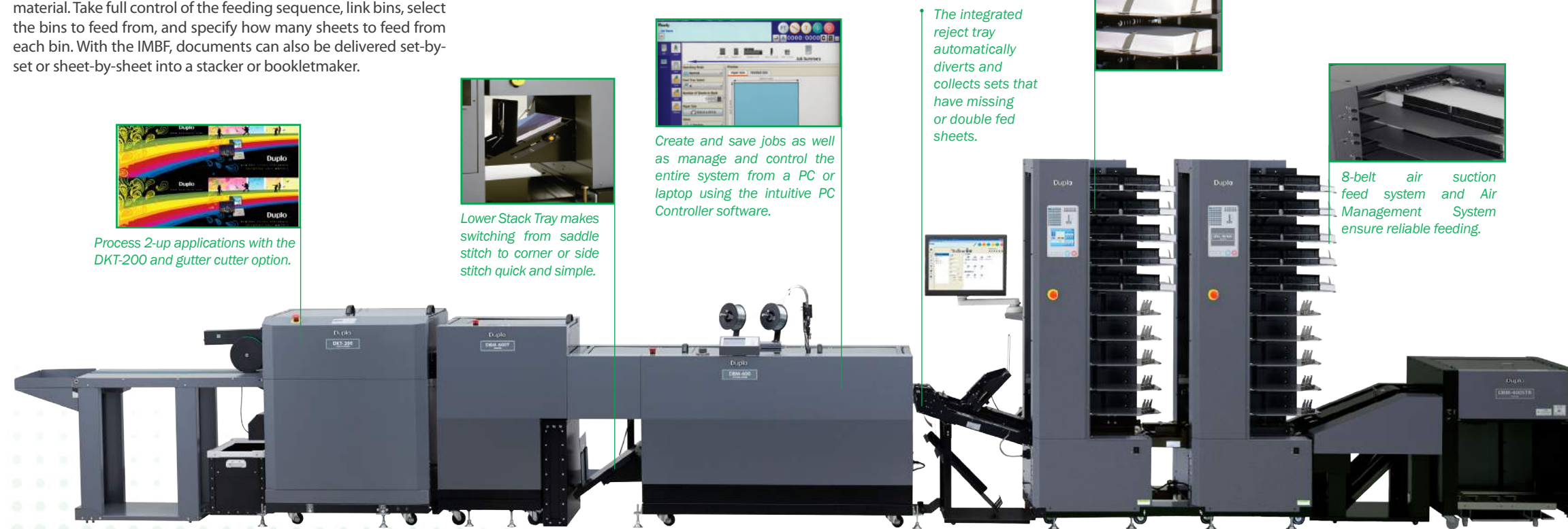
DBM-LSW Long Stacker