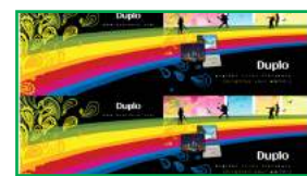
Process 2-up applications with the DKT-200 and gutter cutter option.

* Please note the IMBF feature is only available with the PC Controller and not with the LCD panel.