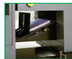
Lower Stack Tray makes switching from saddle stitch to corner or side stitch quick and simple.