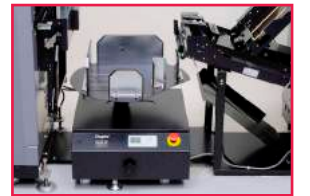
DCR-ST Cross Stacker