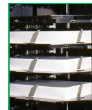
The 2.6" bin capacity supports a variety of paper stocks 52-300 gsm and paper sizes ranging from 4.1" x 5.8" to 14" x 24".

The integrated reject tray automatically diverts and collects sets that have missing or double fed sheets.