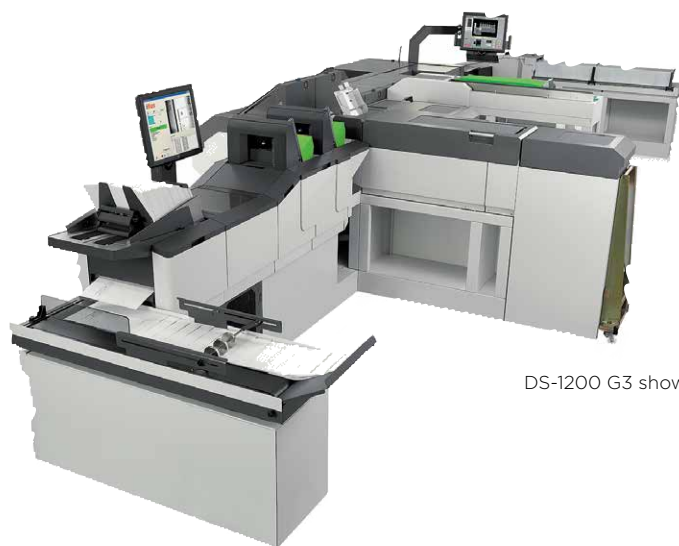
DS-1200 G3 shown

For more information about Quadient, visit quadient.com .