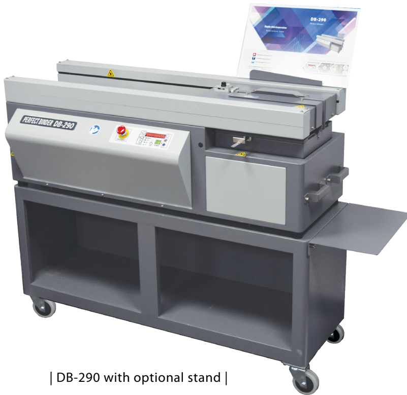
| DB-290 with optional stand |